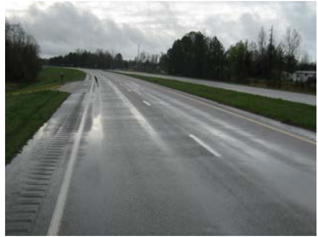
Rutting can lead to ponding of water in wheelpaths and increase the potential for hydroplaning.