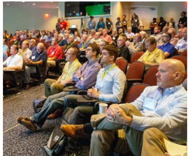
A wealth of data will be shared during the conference planned May 7-9, 2024.