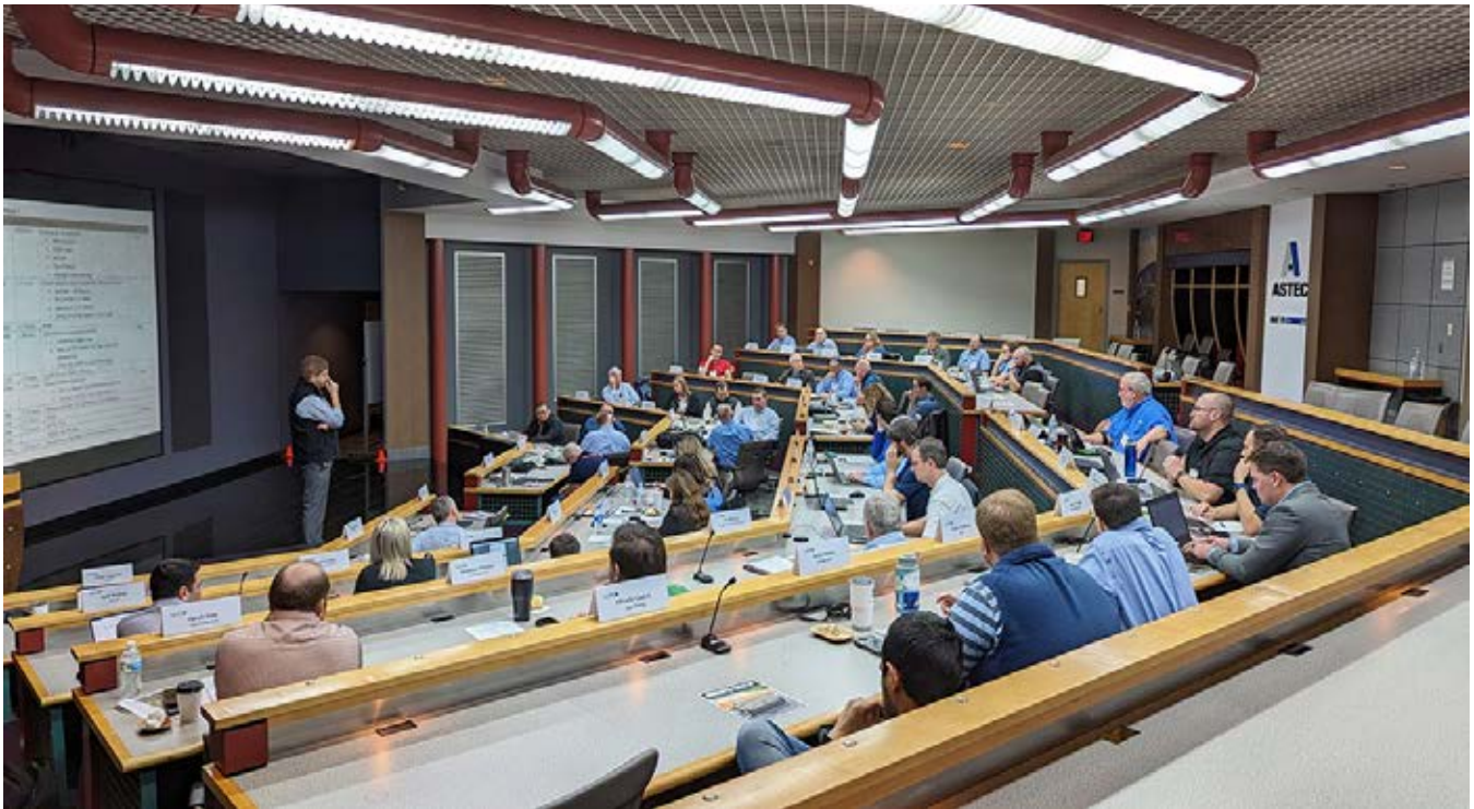
Members of the Consortium for Asphalt Pavement Research and Implementation (CAPRI) met at Astec Inc. in Chattanooga, Tenn. The group, which includes about 50 organizations, also met in Indianapolis, Auburn, Charleston, and plans meetings this fall in Fairfax, Va., and next spring in Ridgeland, Miss.