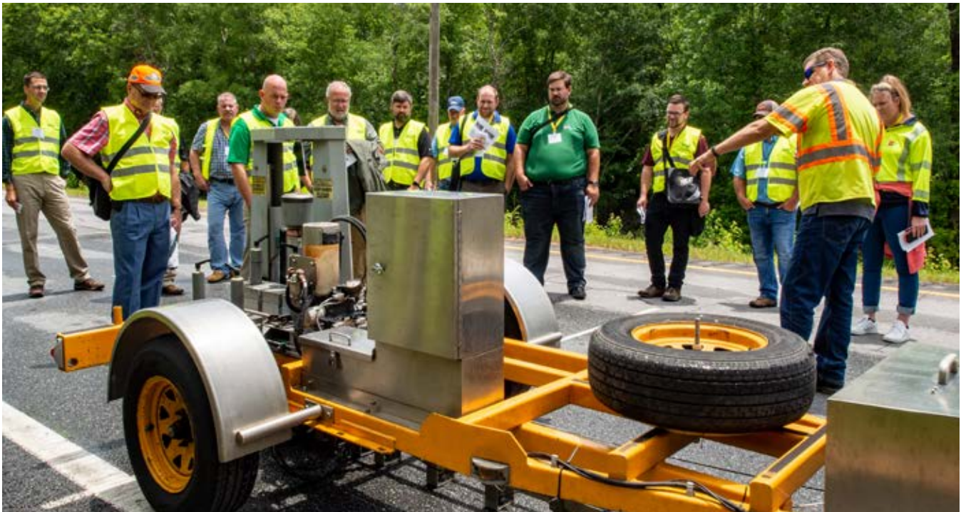
The 2021 Track Conference attracted 218 in-person attendees, including these who inspected the Test Track.