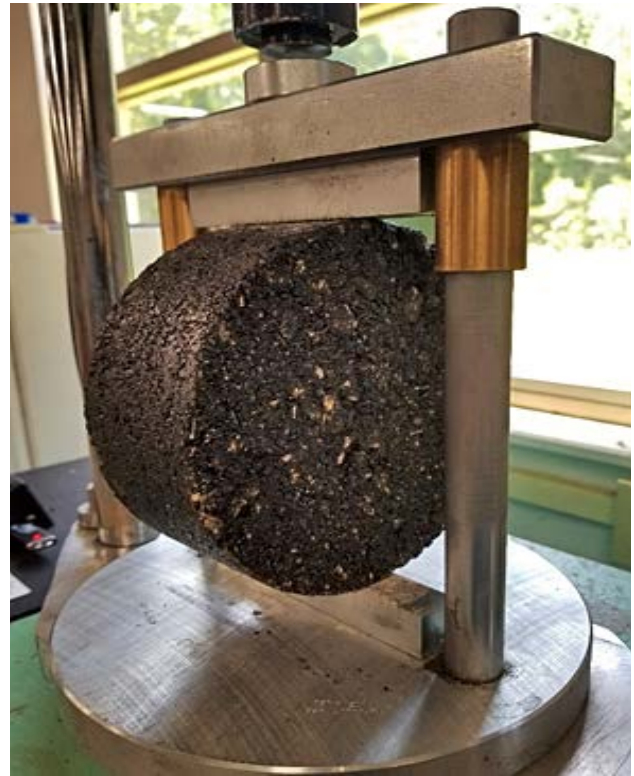
The High-Temperature indirect tension test (HT-IDT).

Based on the relationship between the HT-IDT