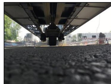
Figure 1. FHWA ALF

In 2013, the FHWA constructed 10 test lanes under the ALF at the Turner-Fairbank Highway Research Center (TFHRC) in McLean, Virginia, to evaluate fatigue performance of reclaimed asphalt pavement (RAP), reclaimed asphalt shingle (RAS), and warm mix technologies (WMT) in mixes. The pavement structure was a 4-inch asphalt layer over a 26-inch granular base over the existing subgrade. The sections were designed as 12.5mm NMAS Superpave (65 N design ). A 425 super-single tire (14,000 lbs. at 100 psi) applied the loading at 11 mph with a normally distributed lateral wander across 40 inches. The effective testing length was 45 feet.