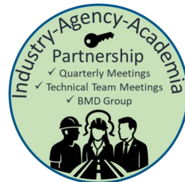
Figure 1. Partnership and Engagement were key to MoDOT's BMD Pilot Success!